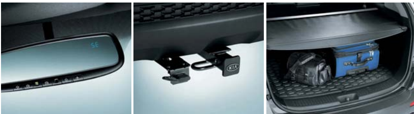
AUTO-DIMMING REAR-VIEW MIRROR WITH HOMELINK®22 AND COMPASS