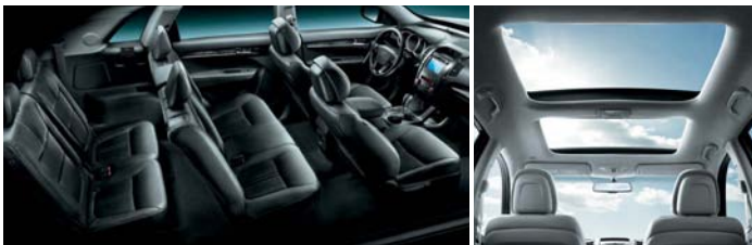
50/50 SPLIT-FOLDING THIRD-ROW SEATS (LX) Requires Convenience Package.