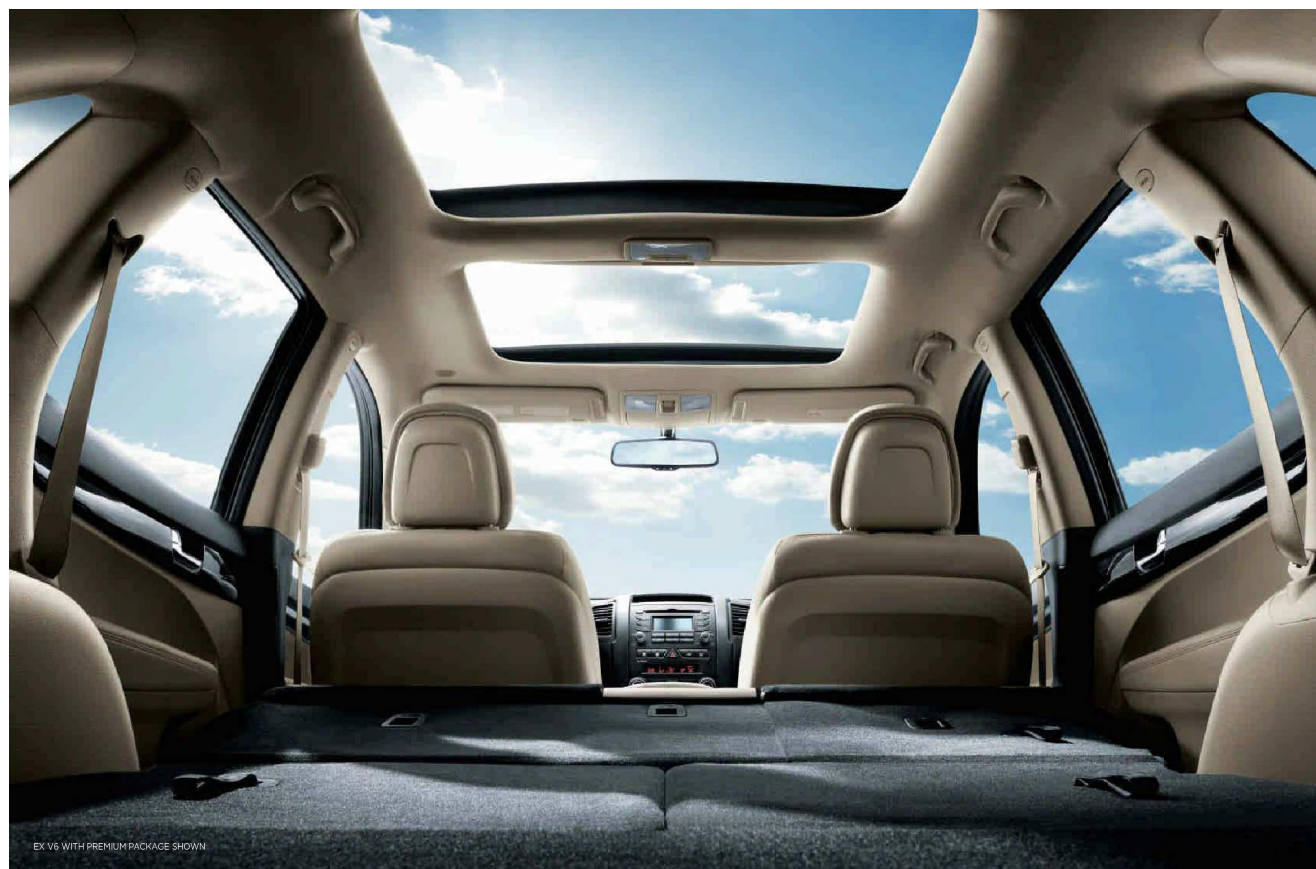
EX V6 WITH PREMIUM PACKAGE SHOWN